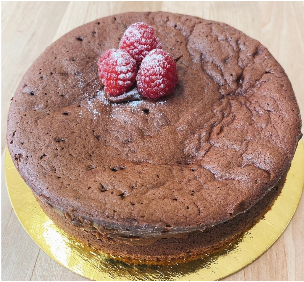
Belgian chocolate cake