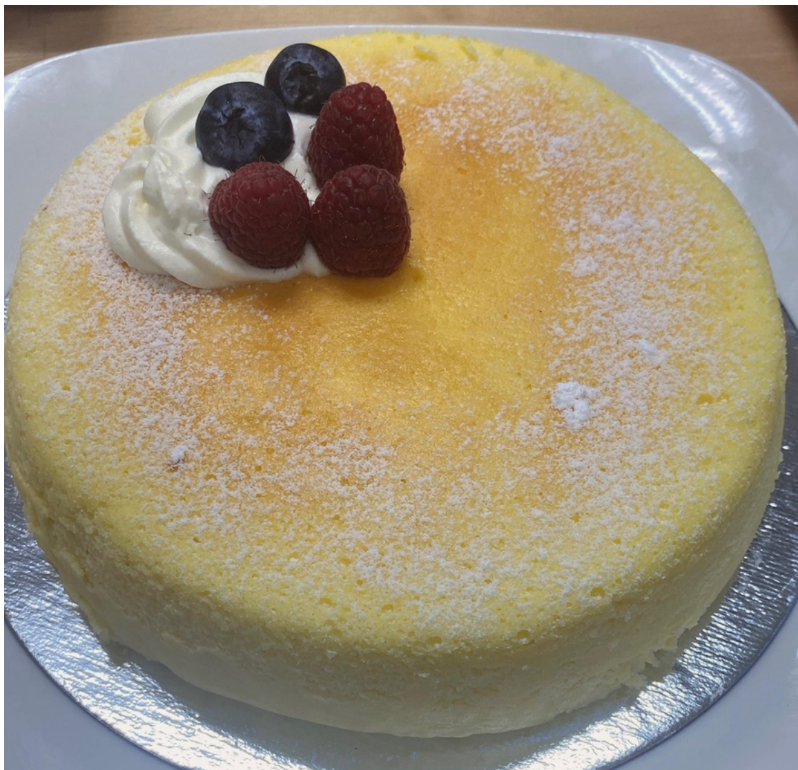
Soufflé cheesecake 7" (no wheat flour)