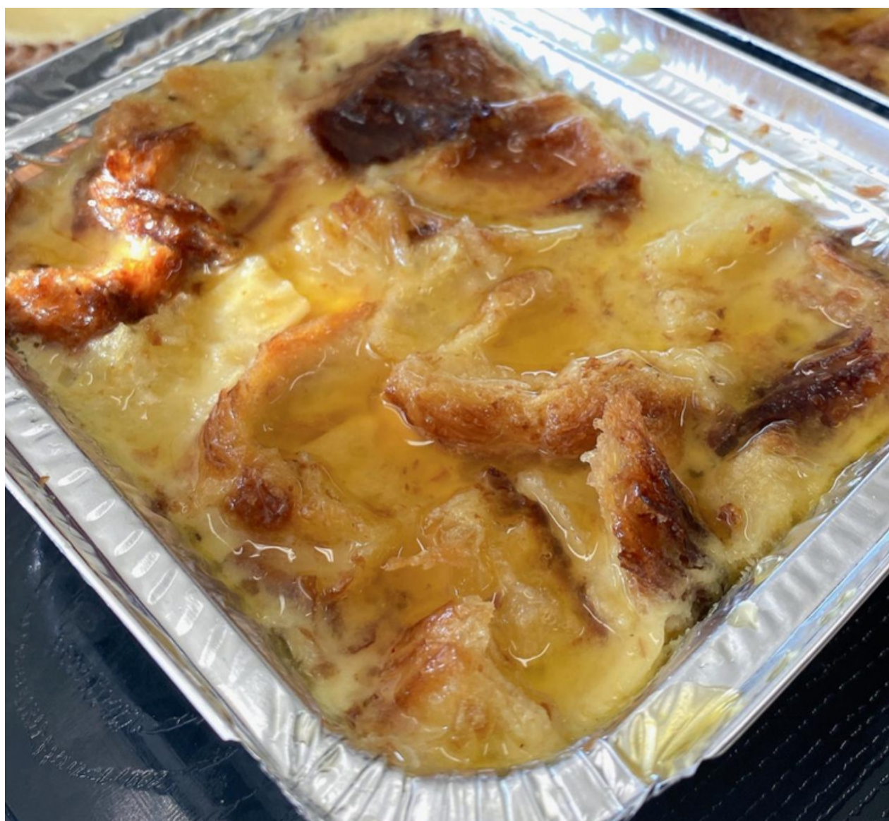
Orange and chocolate chip croissant bread pudding