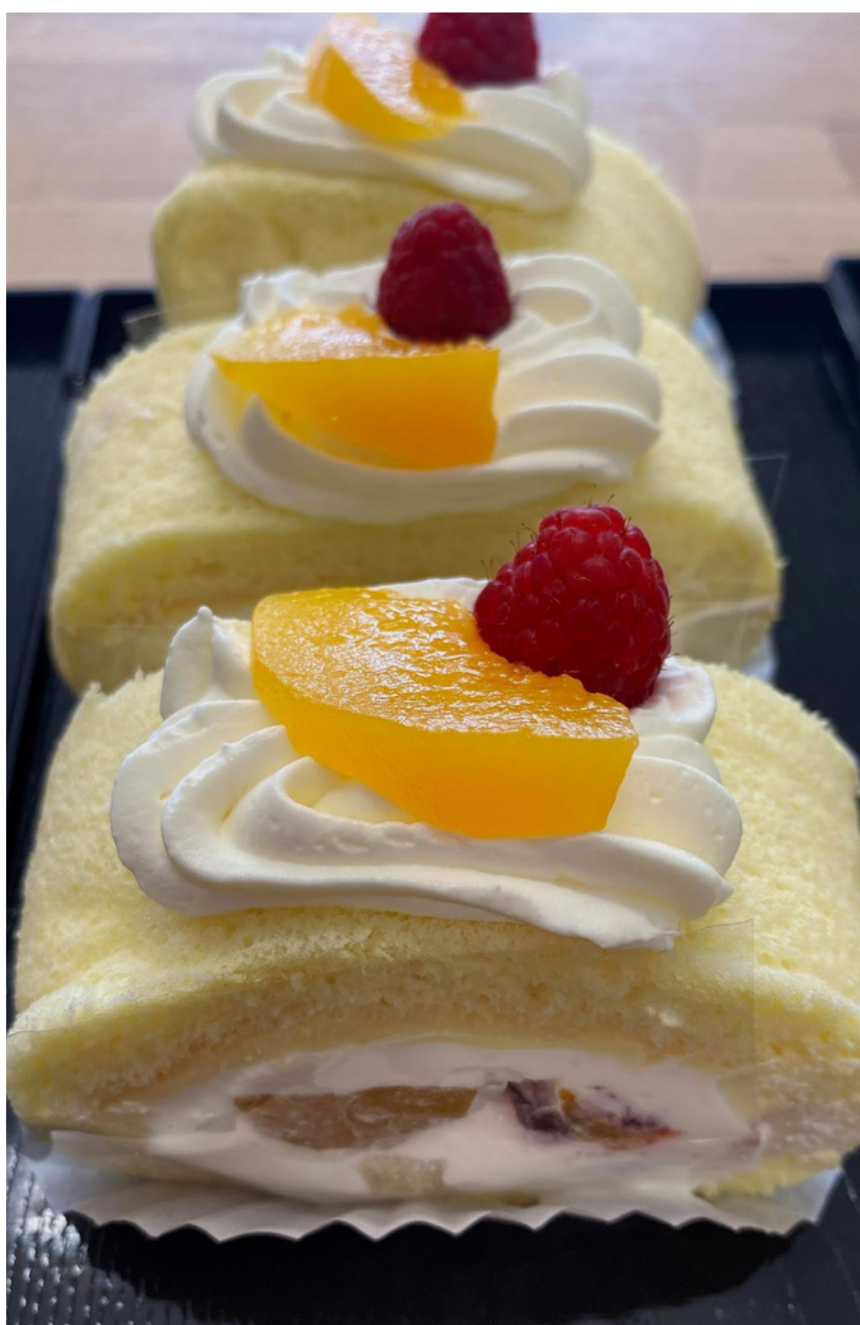
Ontario peach and raspberry roll cake $38, 5-6 servings

Please include your phone number (incase we need to contact you), and an approximate time you'd like to pick up your order.