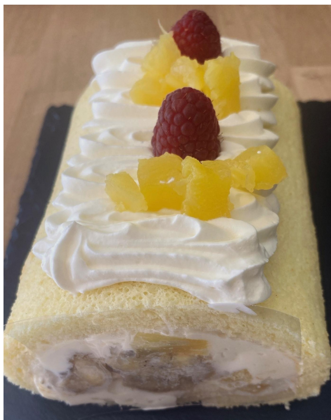
Caramelized banana, pineapple compote and white chocolate Chantilly cream roll cake $40, 5-6 servings