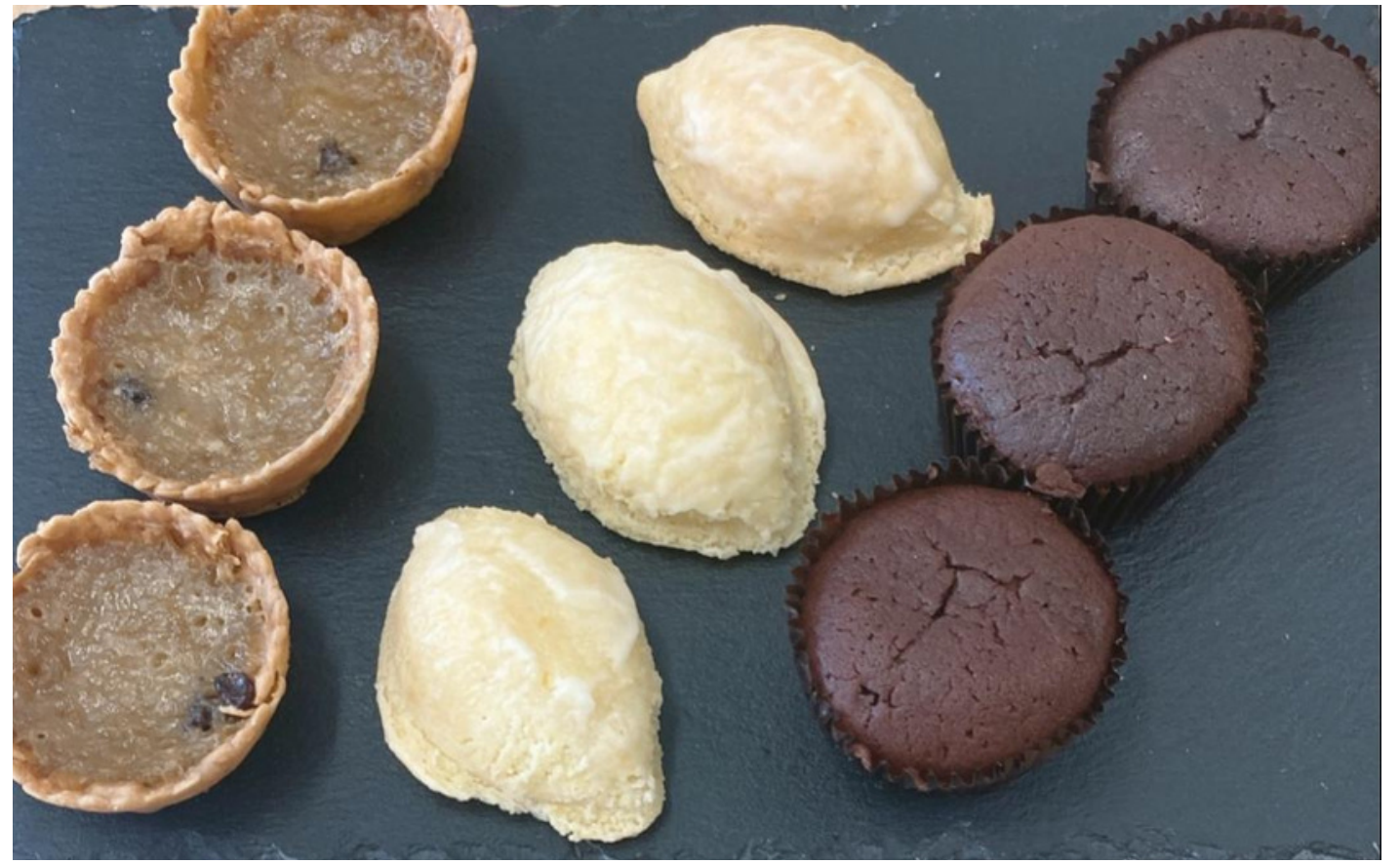
3 mini lemon cake

3 mini butter tarts (with or without dried currants)