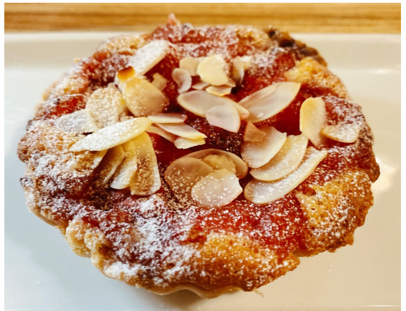
Ontario spring rhubarb and strawberry frangipane tart